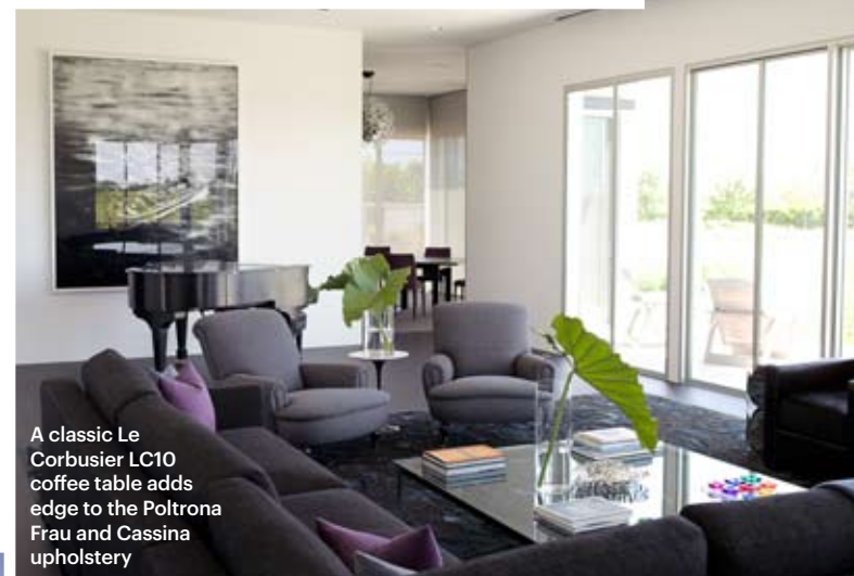
A classic Le Corbusier LC10 coffee table adds edge to the Poltrona Frau and Cassina upholstery