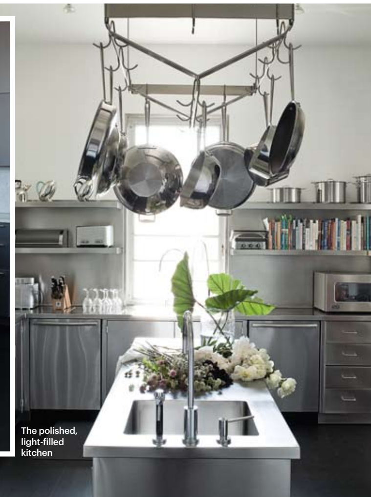
The polished, light-filled kitchen