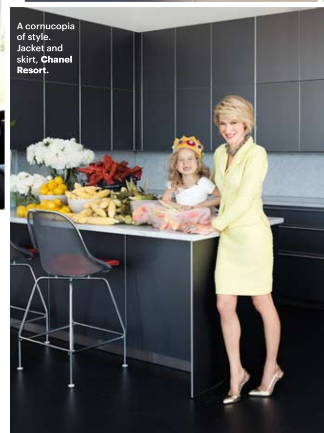
A cornucopia of style. Jacket and skirt, Chanel Resort.