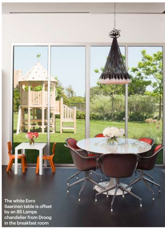
The white Eero Saarinen table is offset by an 85 Lamps chandelier from Droog in the breakfast room

For more images of Macklowe's personal style, go to bazaar.com/juliemacklowe